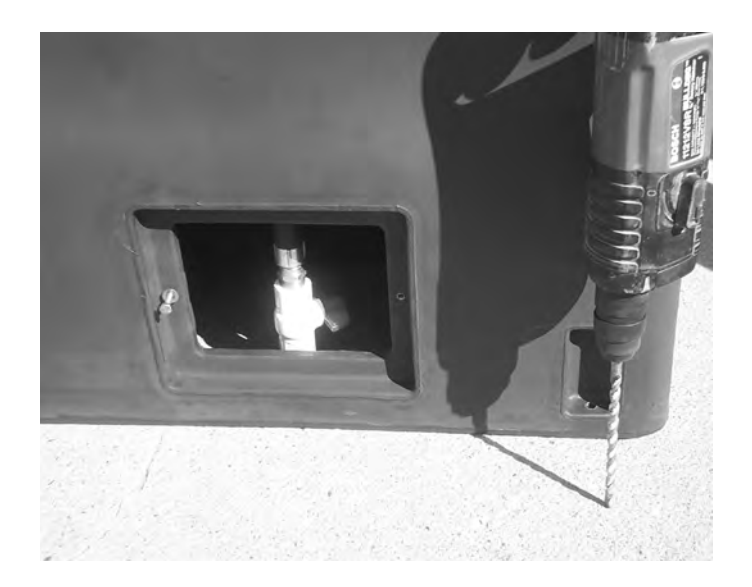
Step 4 After marking anchor bolt locations with a pencil, drill 4-3/8" holes for the 3/8" x 4" anchor bolts included in your parts package.

*NOTE: When using the 250 watt Miraco heater, install with a properly grounded electrical line. The heater is to be placed in the valve compartment under the 4x5 bob float. The power cord is connected in the area where the water line is located.