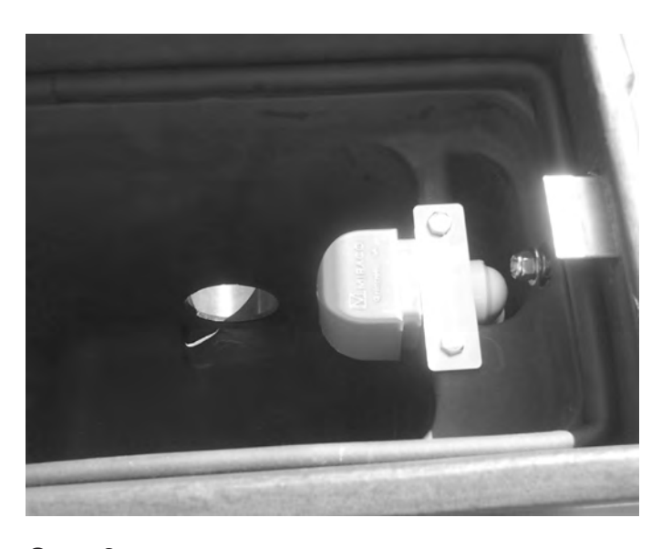
Step 6 Now push the valve assembly down into the molded cradle and secure with the stainless steel retainer and 2-1/4" x 1" bolts. Tighten until valve is tight.