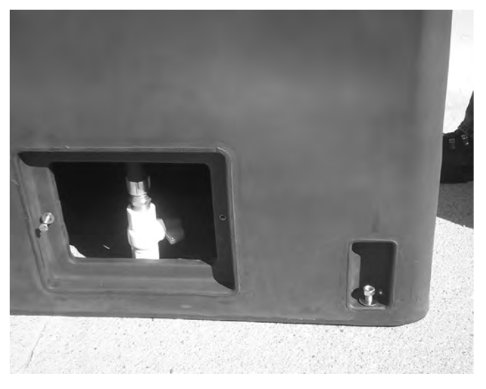
Step 5 After driving your anchor bolts into the concrete (be careful not to drive in too far), set the tank over the bolts and secure with nuts and washers.