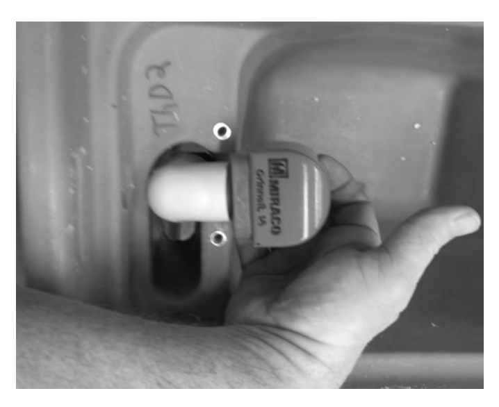
Step 3 After attaching your hose and shutoff valve assembly, lift the tank over the hose and feed the hose up through the small opening into the valve compartment. Attach the blue valve and PVC fittings to the hose. Use teflon tape on all fittings to prevent leaks.