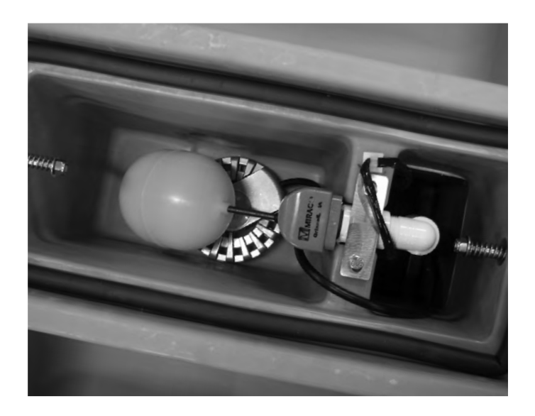
Step 8 Lay your 250 watt heater in the bottom of the valve compartment. Put the plug down the opening into the area below the tank. This is where you plug in both the tank heater and line heater. Attach your float assembly to the valve and turn the water on and adjust your water level. During warm weather remove the heater and hang in a dry area.

Do not wrap on the line. Let the heat cord hang alongside the water line, and attach with nylon zip ties to the water line for best results.