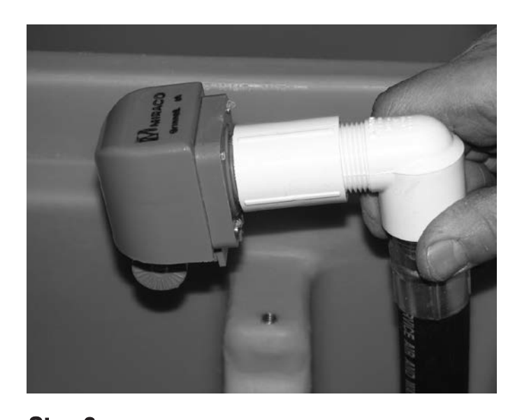
Step 3 After attaching your hose and shutoff valve assembly, lift the tank over the hose and feed the hose up though the small opening into the valve compartment. Attach the blue valve and PVC fitting to the hose. Use teflon tape on all fittings to prevent leaks.