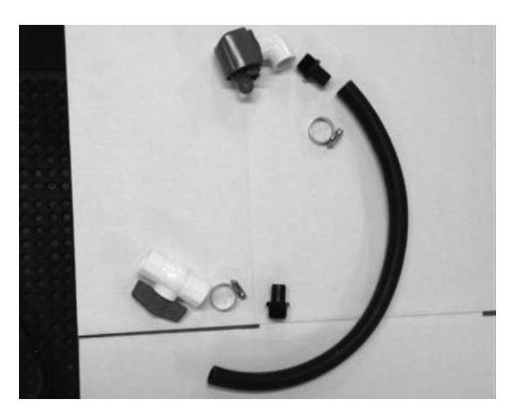
Step 2 Attach the rubber hose and shutoff valve assembly to your incoming water line. Use teflon tape on all fittings to prevent leaks.