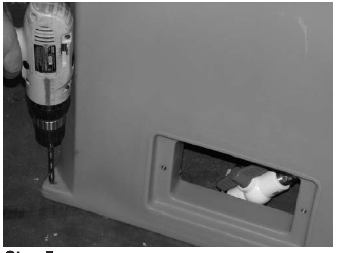
Step 5 Align your tank on the pad and drill 4-%" holes in the concrete to accept stainless steel anchors %" x 4".