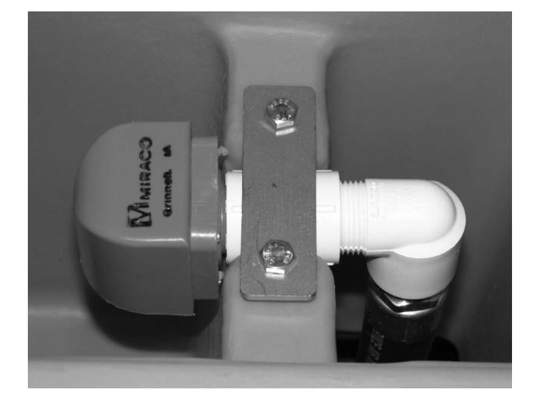
Step 4 Now push the valve assembly down into the molded cradle and secure with the stainless steel retainer and 2-1/4" x 1" bolts. Tighten until valve is tight.

*NOTE: When using the 250 watt Miraco heater, install with a properly grounded electrical line. The heater is to be placed in the valve compartment under the 4x5 bob float. The power cord is connected in the area where the water line is located.