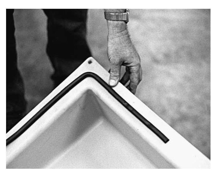
Step 1 Pull the paper off the back of the rubber gasket and stick to the bottom edge of the tank. This is important to keep out air and water.