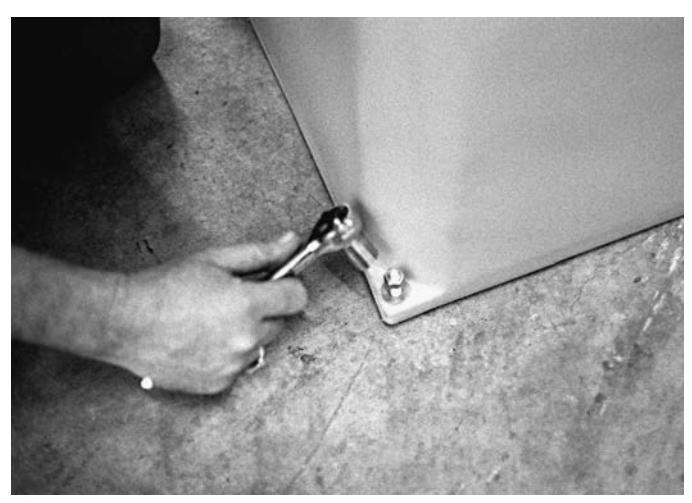
Step 6 Tighten your anchor bolts.

Lay your 250 watt heater in the bottom of the valve compartment. Put the plug down the opening into the area below the tank. This is where you plug in both the tank heater and line heater. Attach your float assembly to the valve and turn the water on and adjust your water level. During warm weather remove the heater and hang in a dry area.