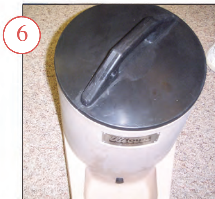
6 Lid will twist approximately 1/4 turn until tight.