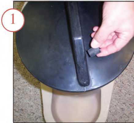
1 Remove plug from inside unit or top storage hole.