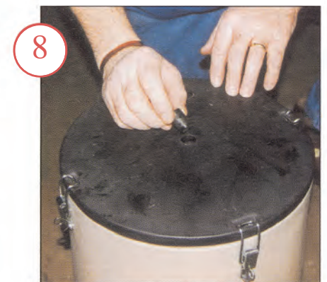
8 Replace plug in the storage hole located in the lid for future use.