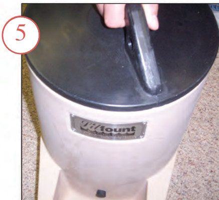
5 Place lid on top of waterer so the handle (plug end) is even with the edge of the label. Push down evenly all around and twist on.