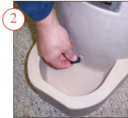
2 Insert plug into fill hole.