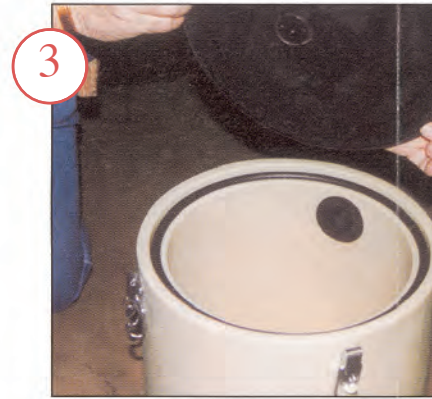
3 Remove lid. (First time use: stretch rubber "o" ring until it fits easily into the groove.)