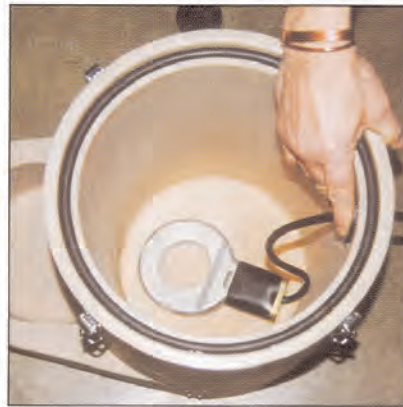
Optional 250 watt heater assembly

The unique features of this waterer make it owner friendly and user friendly. Easy fill, easy cleaning.