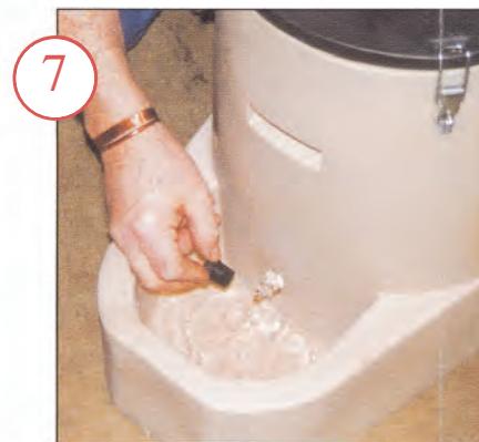
7 Remove rubber plug and allow water to flow into dish.